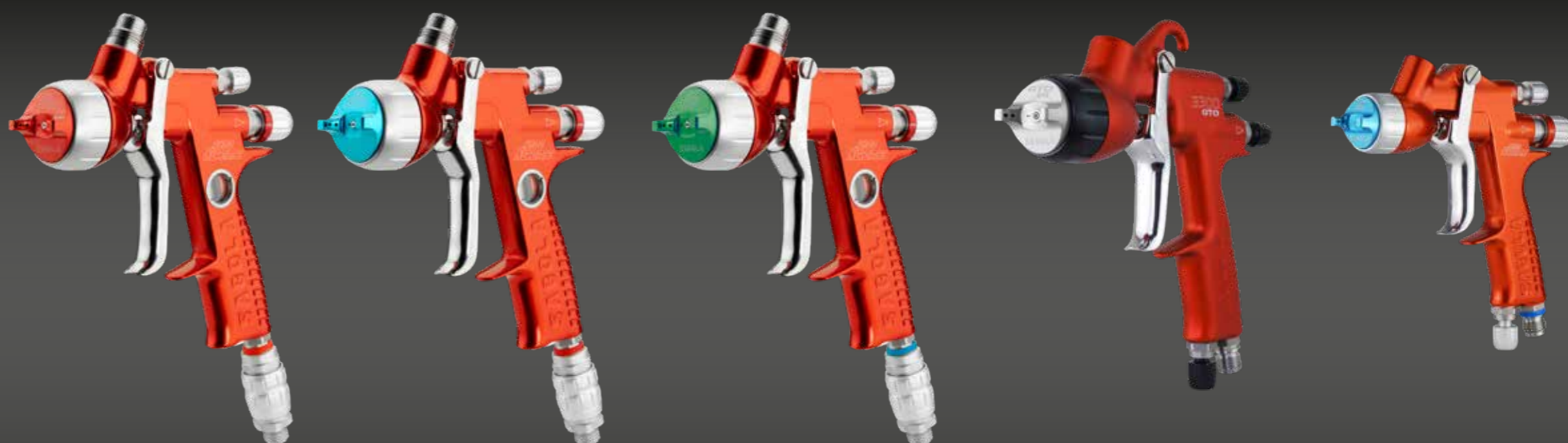
4600 Xtreme HS